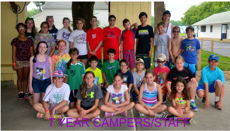
7 YEAR CAMPERS/STAFF