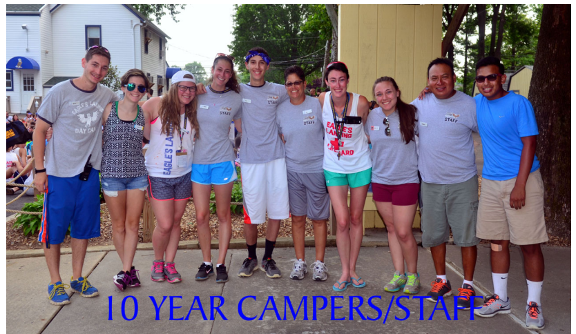
10 YEAR CAMPERS/STAFF