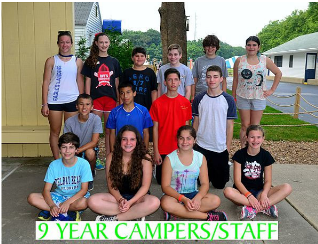
9 YEAR CAMPERS/STAFF