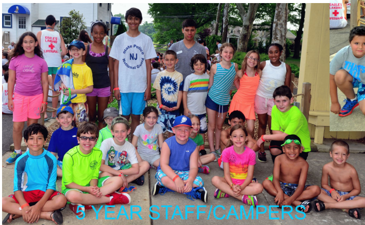
5 YEAR STAFF/CAMPERS