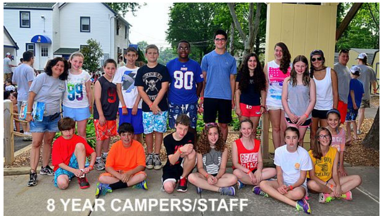
8 YEAR CAMPERS/STAFF