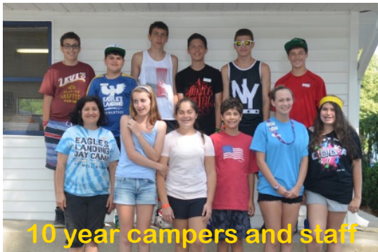
10 year campers and staff