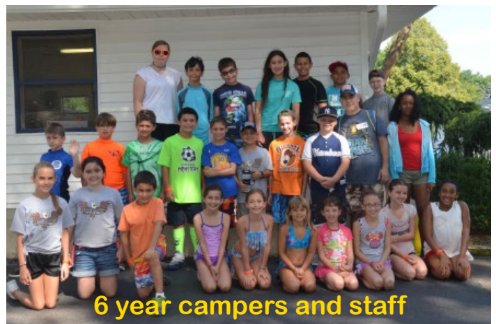
6 year campers and staff