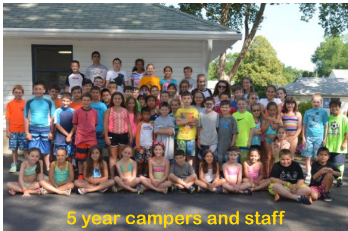
5 year campers and staff