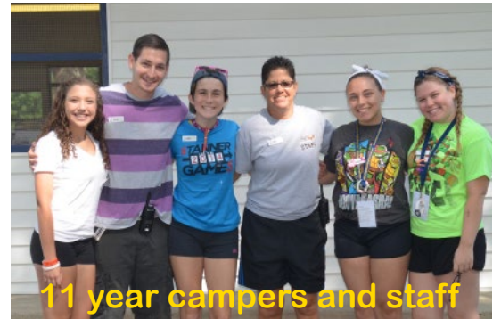
11 year campers and staff