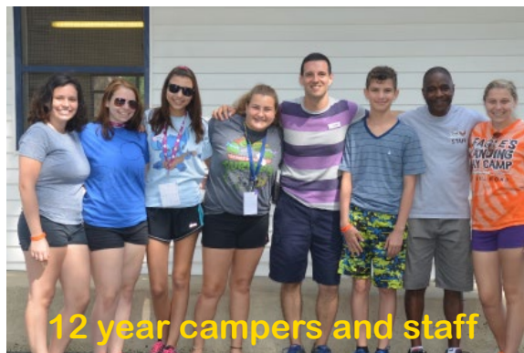
12 year campers and staff