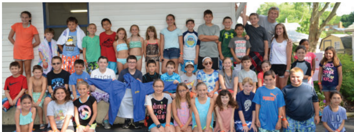
The following campers are returned for their 6th year and received a Eagle's Landing jacket: