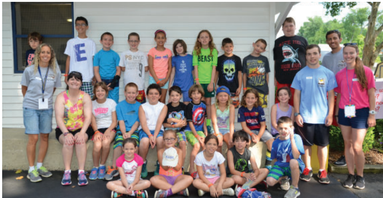
The following campers returned for their 5th year and received a Eagle's Landing hat: