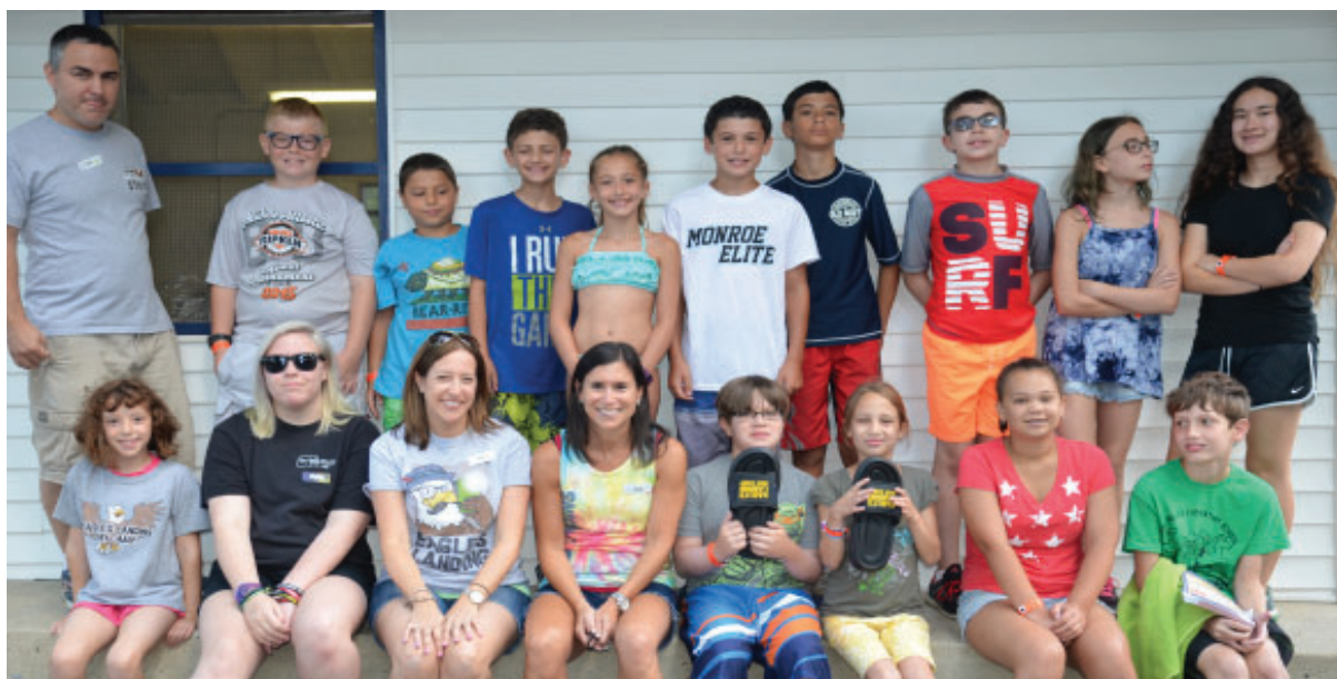
The following campers are returned for their 7th year and received Eagle's Landing flip flops: