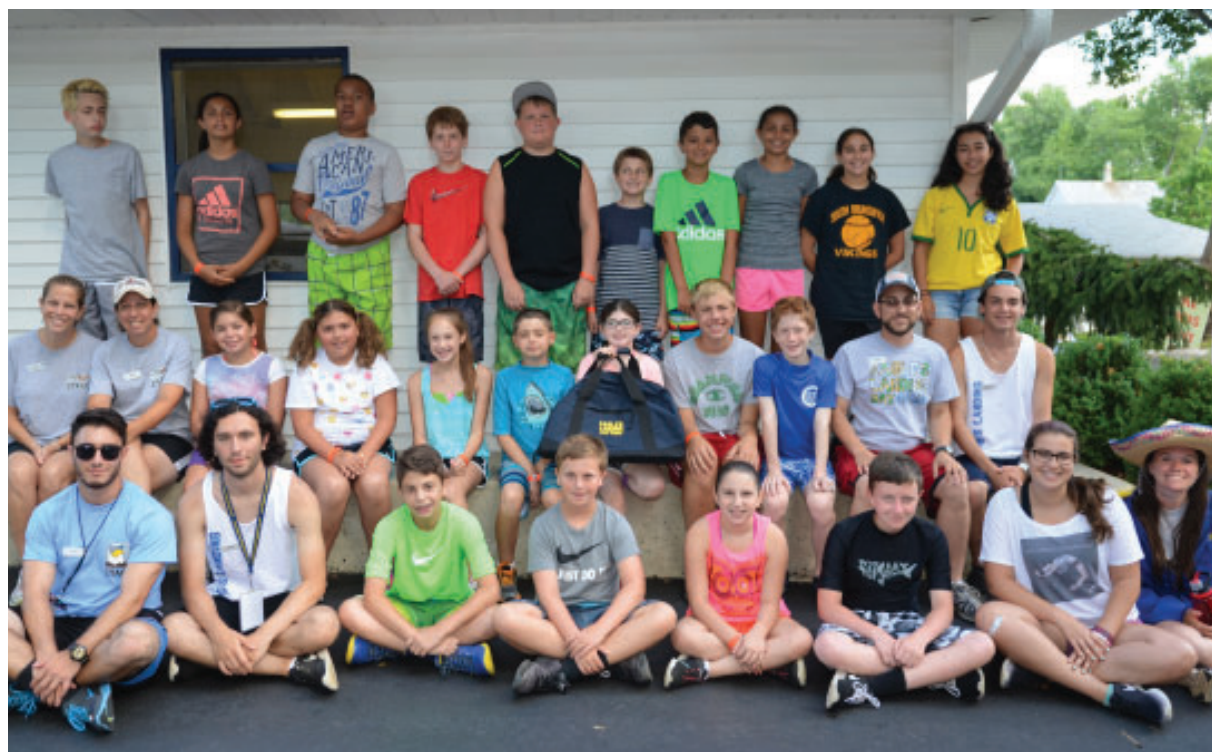
The following 8th year campers received Eagle's Landing duffel bag: