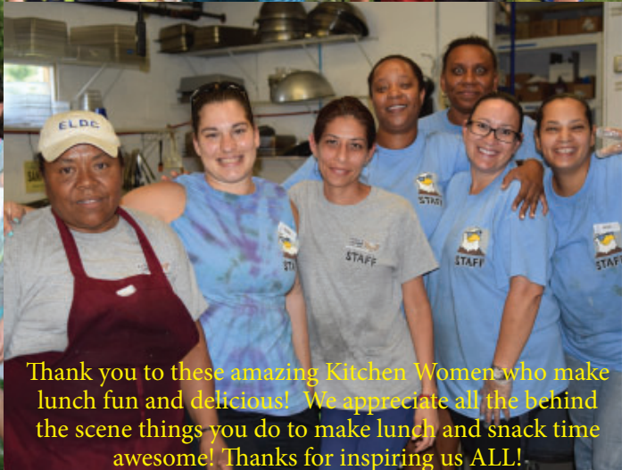
Thank you to these amazing Kitchen Women who make lunch fun and delicious! We appreciate all the behind the scene things you do to make lunch and snack time awesome! Thanks for inspiring us ALL!