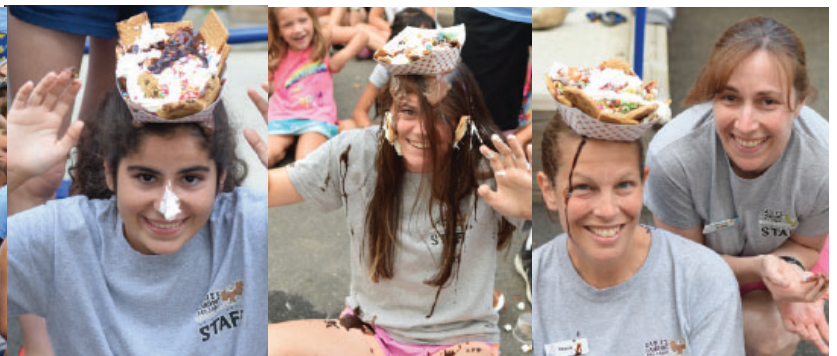
More Morning Gathering Fun.... Pudding Sundaes "a la STAFF"

EAGLE'S LANDING DAY CAMP THEATER PRESENTS