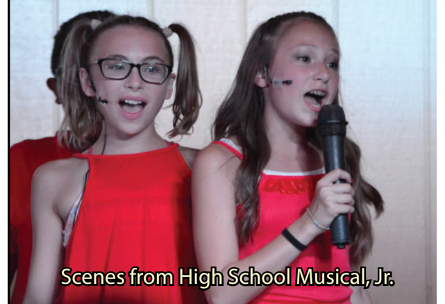
Scenes from High School Musical, Jr.

Congratulations to the Cast of Elementary Blues & High School Musical, Jr. We all LOVED watching you PERFORM!