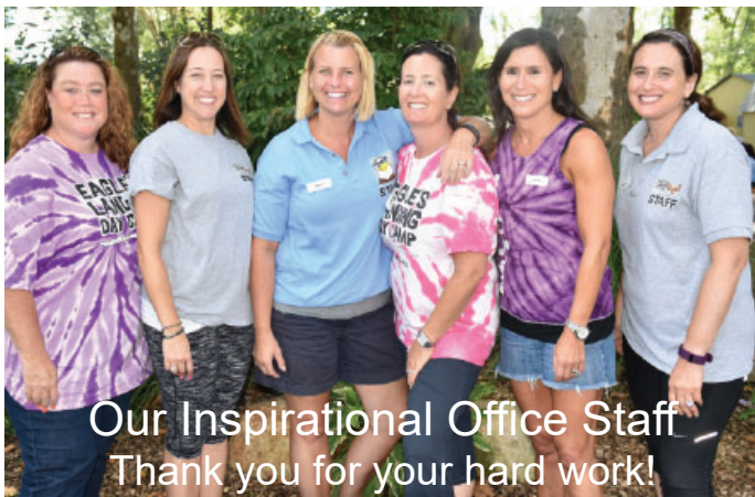
Our Inspirational Office Staff Thank you for your hard work!