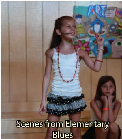
Scenes from Elementary Blues