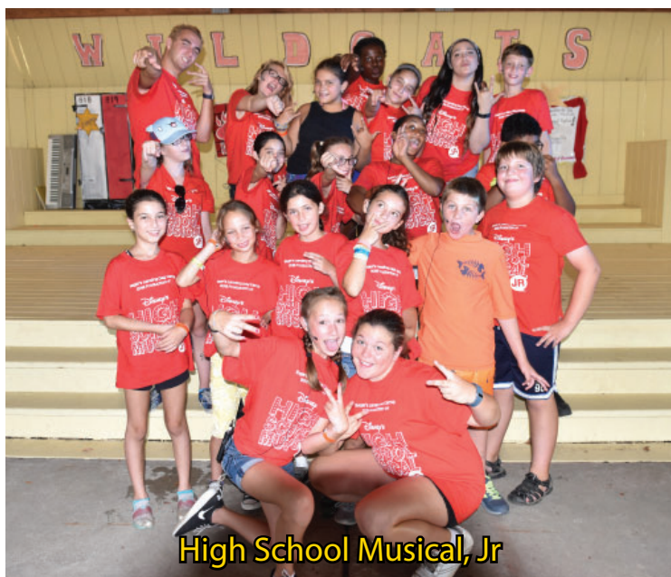
High School Musical, Jr