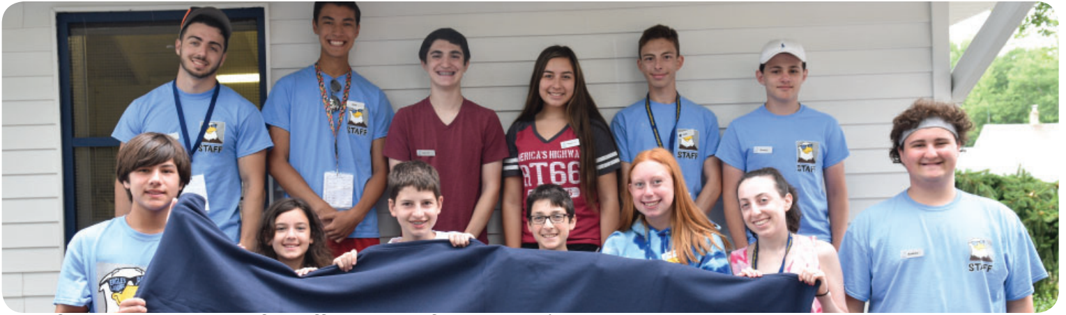
The following campers & staff returned for their 10 th year and received an Eagle's Landing blanket: