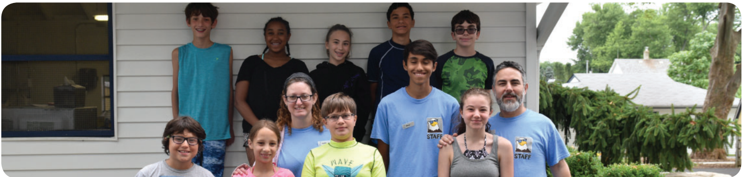
The following campers & staff returned for their 8 th year and received an Eagle's Landing duffel bag: