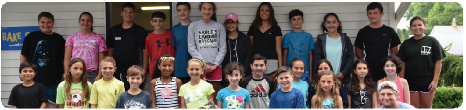
The following campers & staff returned for their 7 th year and received Eagle's Landing flip flops: