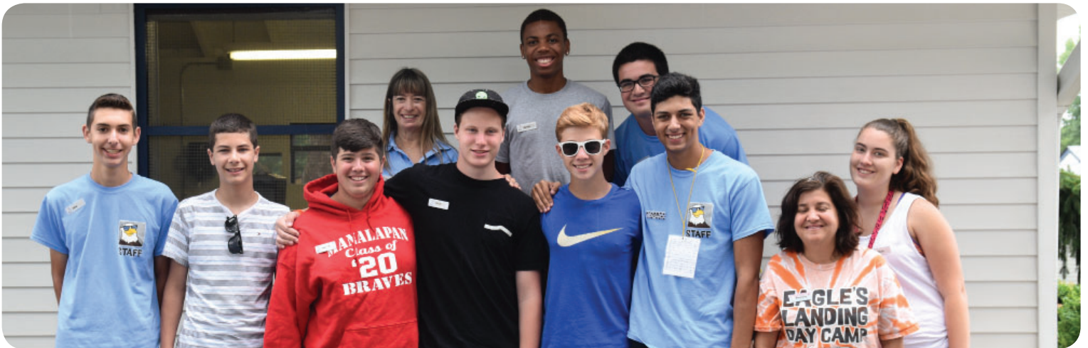
The following campers & staff returned for their 11 th year and received an Eagle's Landing watch: