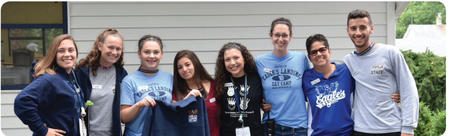
The following campers & staff returned for their 13 th year and received an Eagle's Landing fleece pullover: