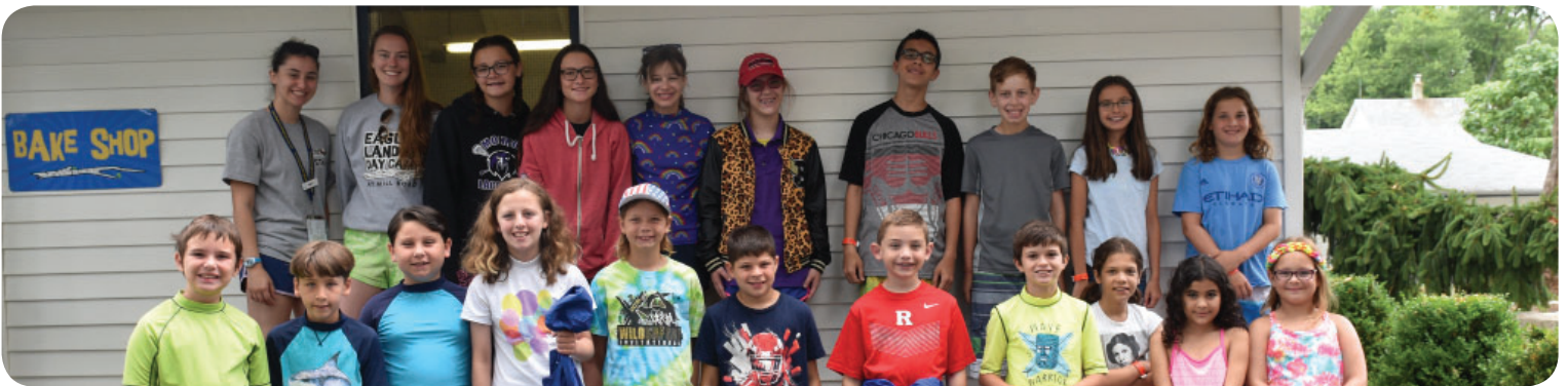
The following campers & staff returned for their 6 th year and received an Eagle's Landing jacket: