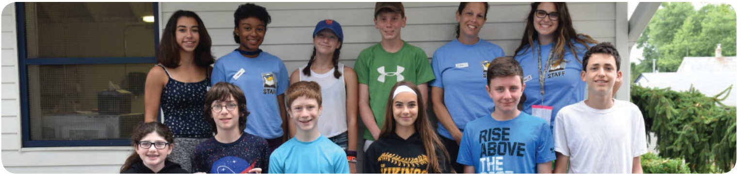
The following campers & staff returned for their 9 th year and received an Eagle's Landing pinnie: