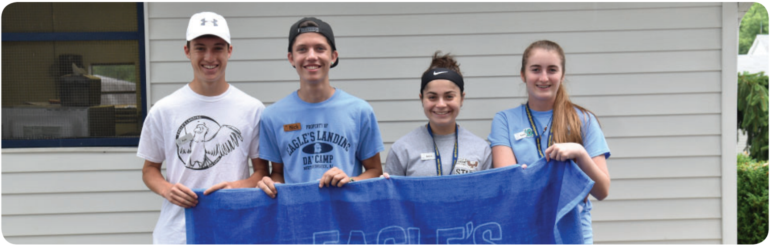
The following campers & staff returned for their 12 th year and received an Eagle's Landing towel: