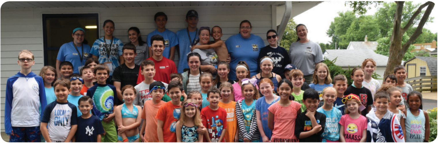
The following campers & staff returned for their 5 th year and received an Eagle's Landing hat: