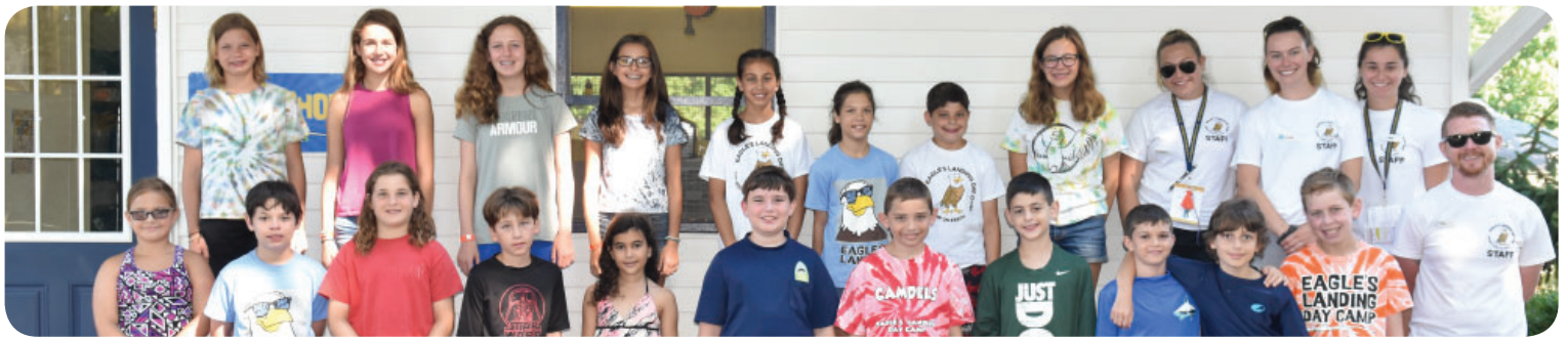
The following campers & staff returned for their 7 th year and received Eagle's Landing flip flops: