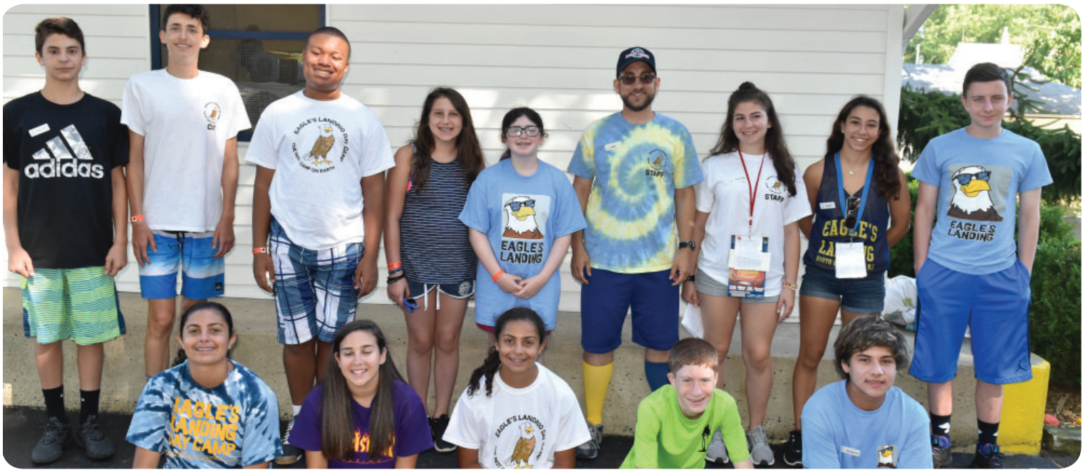
The following campers & staff returned for their 10 th year and received an Eagle's Landing blanket: