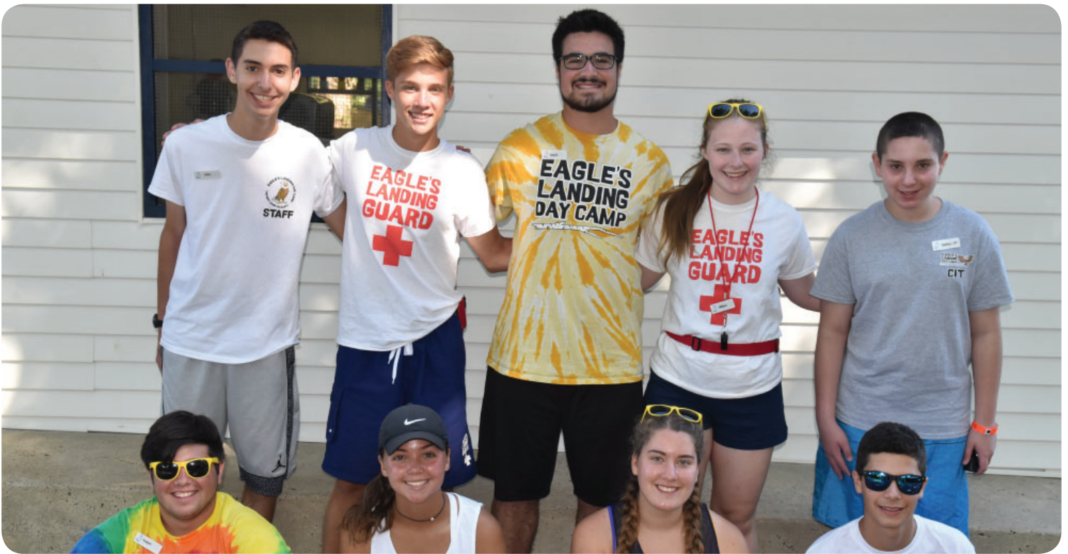
The following campers & staff returned for their 12 th year and received an Eagle's Landing Towel: