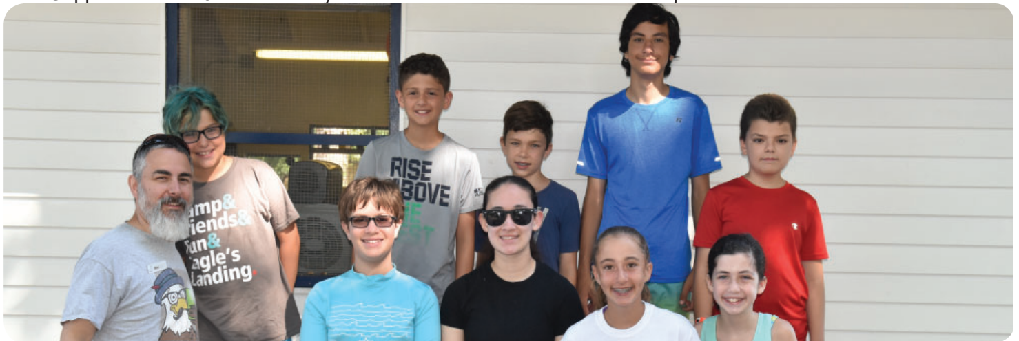
The following campers & staff returned for their 9 th year and received an Eagle's Landing pinnie: