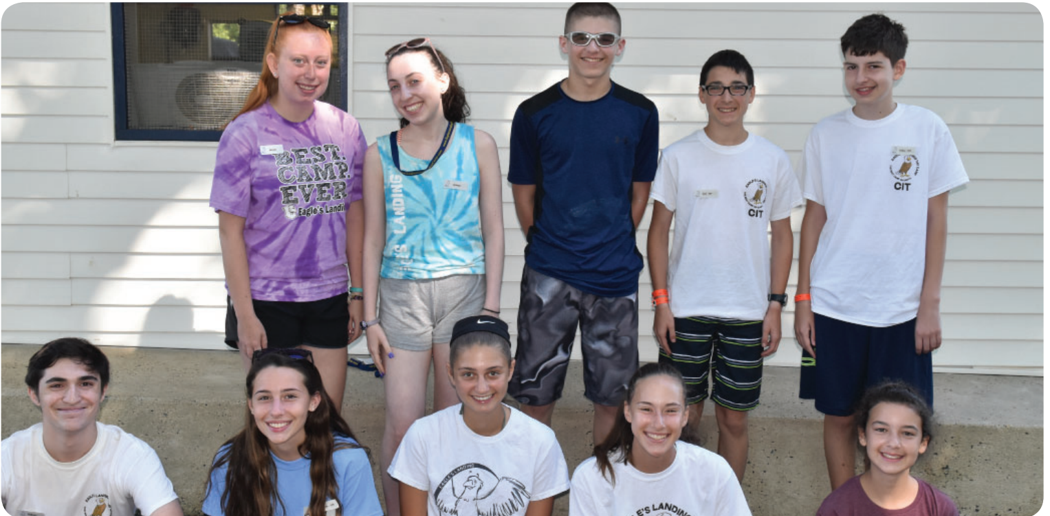
The following campers & staff returned for their 11 th year and received an Eagle's Landing watch: