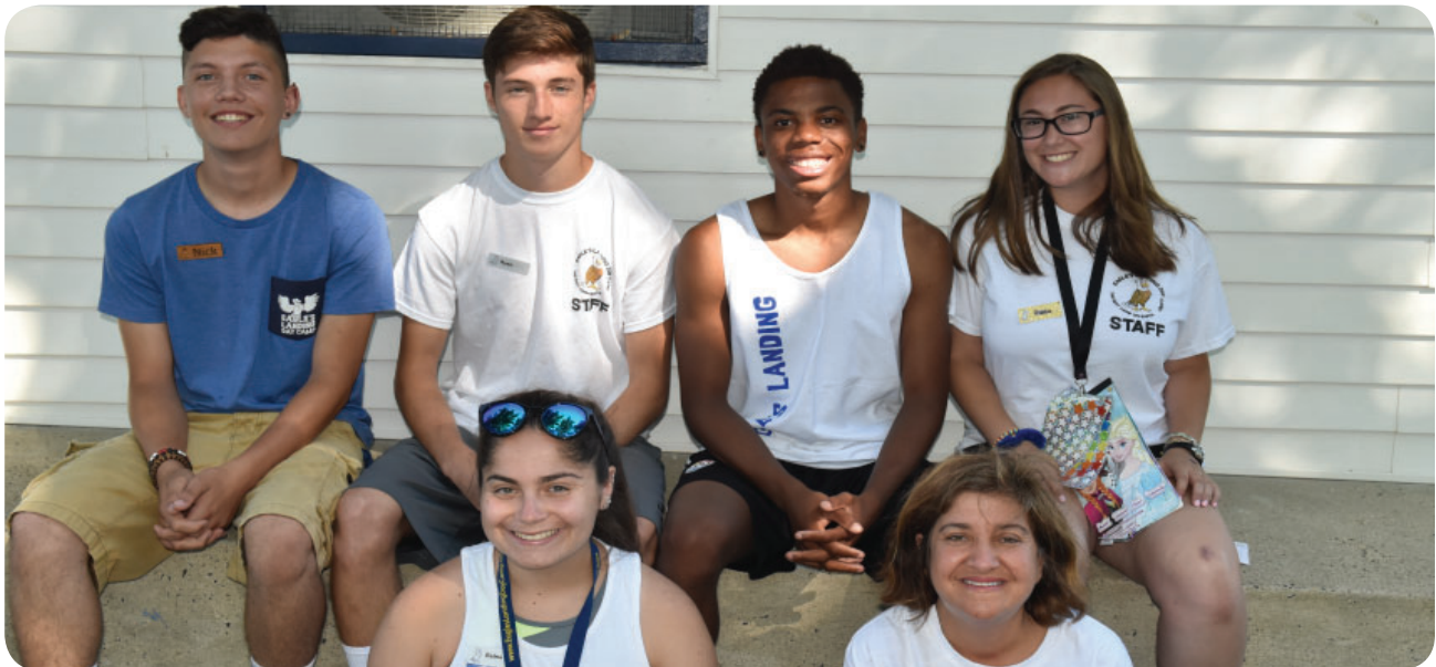
The following campers & staff returned for their 13 th year and received an Eagle's Landing fleece pullover: