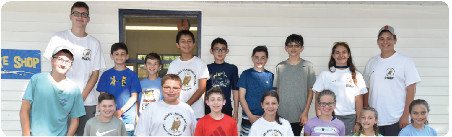
The following campers & staff returned for their 8 th year and received an Eagle's Landing duffel bag: