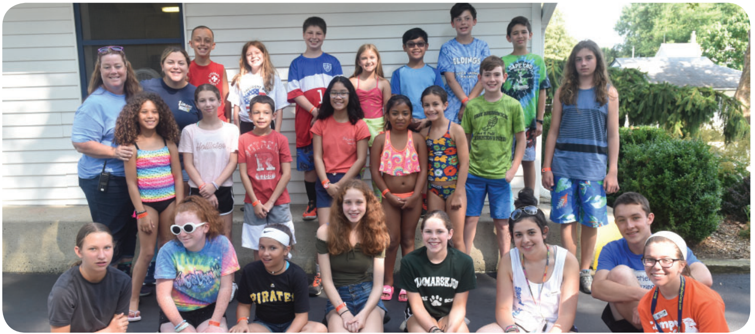
The following campers & staff returned for their 7 th year and received Eagle's Landing flip flops: