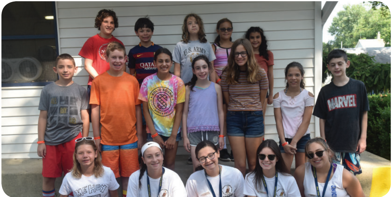
The following campers & staff returned for their 8 th year and received an Eagle's Landing duffel bag: