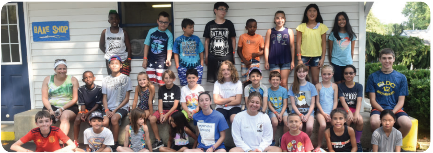
The following campers & staff returned for their 5 th year and received an Eagle's Landing hat: