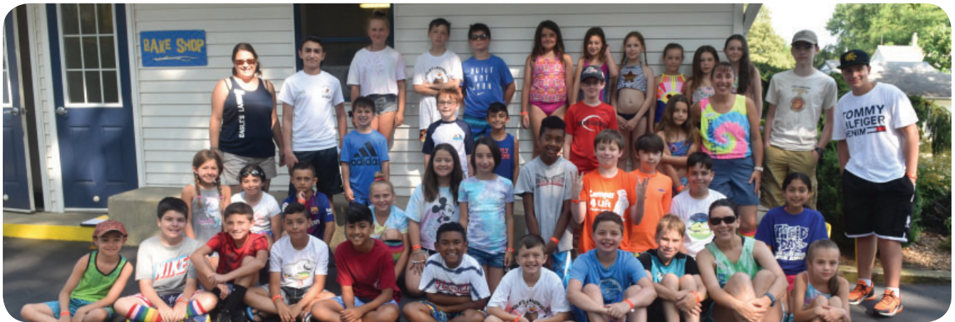
The following campers & staff returned for their 6 th year and received an Eagle's Landing jacket: